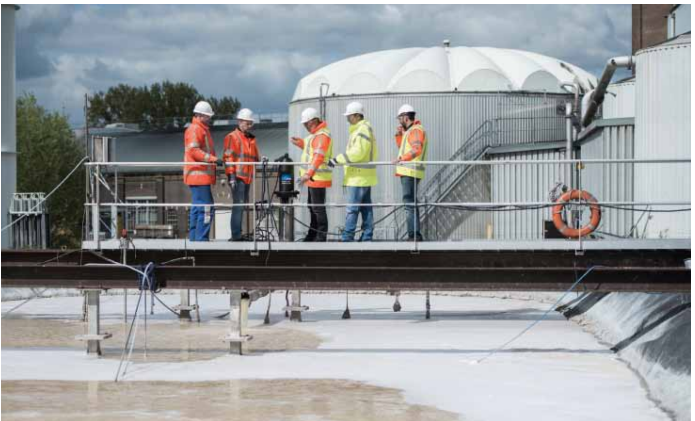
SOLVOX mobile installation at an industrial wastewater plant in the Netherlands.

Seasonal fluctuations in temperature can be another pressure point. As temperatures rise in the summer months, so too does the temperature of wastewater. Aerobic bacteria are more active in warmer waters, raising the oxygen demand for BOD (biochemical oxygen demand) treatment, coupled with the reduced solubility of oxygen. As a consequence, the level of dissolved oxygen (DO) in the aeration basin drops, potentially generating, if the drop in DO is severe enough, anoxic zones. These can lead to the formation of process upsets, such as poor settlement in the secondary clarifiers. In extreme cases, anaerobic activity increases, which, in turn, can lead to the production of malodorous gases, such as hydrogen sulphide, being released into the surrounding atmosphere. Plant odors can create community issues, and excessive BOD breakthrough and/or increases in final effluent suspended solids can create compliance problems or even result in fees or fines from water treatment authorities.