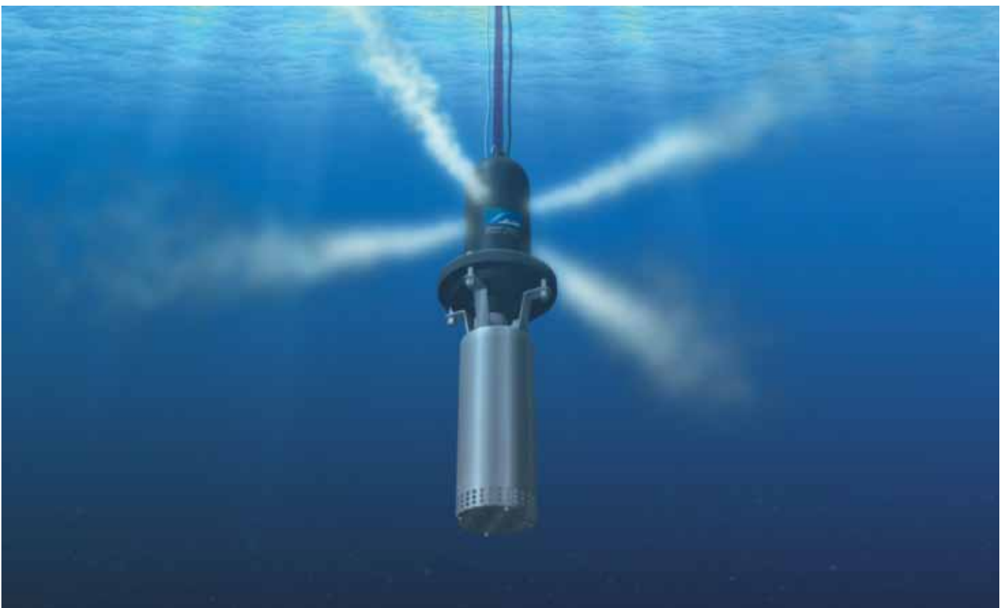
Good mixing power and efficient oxygen transfer performance are essential to achieve homogeneous oxygen dissolution and to achieve ideal DO levels.

Experience has shown that the biological treatment of industrial wastewater can generally be significantly enhanced through a secondary treatment stage with dissolved oxygen levels above 2 mg/l. Our SOLVOX® family of oxygen dissolution technologies has been developed specifically for this application: the high driving force of pure oxygen, additional process mixing and efficient oxygen transfer performance of the SOLVOX process results in excellent oxygen utilization performance and high transfer rates. Assembly and installation requirements are minimal, with little or no construction work required. SOLVOX systems are ready to operate within a very short period of time and can also be installed in fully operational tanks, avoiding the cost and inconvenience associated with process shutdowns and drain downs.