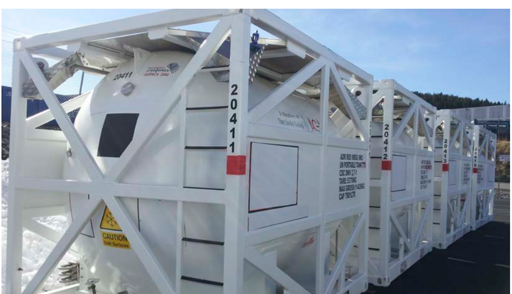
Offshore cryo tanks 6 Bar.